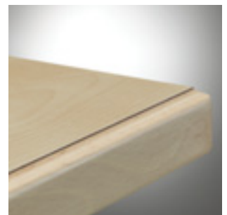
25mm Hardwood leading edge (standard). Other edges are available on request